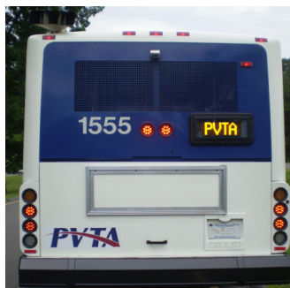
Tail Frame 50”L x 17”H