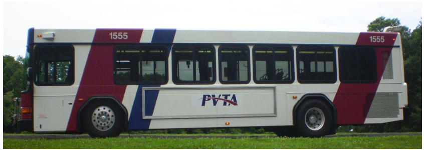
King Frame 144”L x 30”H