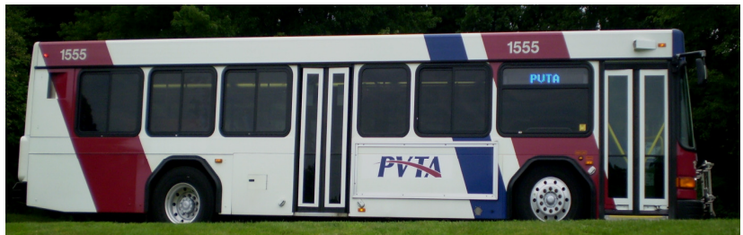
Queen Frame 108”L x 30”H